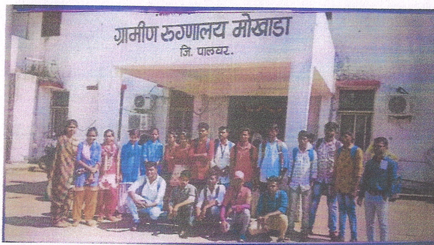
S.Y.B.Sc. Visit to Rural Hospital, Mokhada