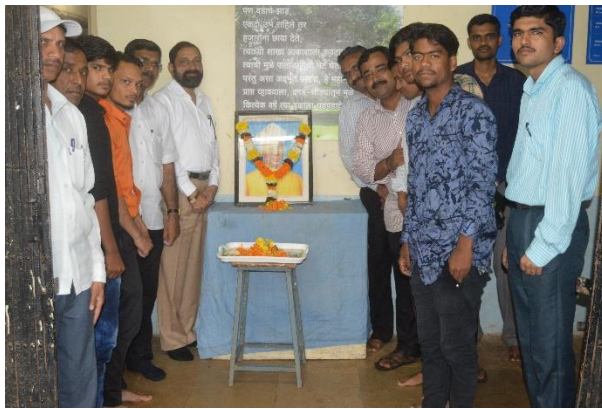
Dr. SarvPalli Radhakrishnan Jayanti