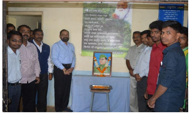
Subhash Bose Jayanti