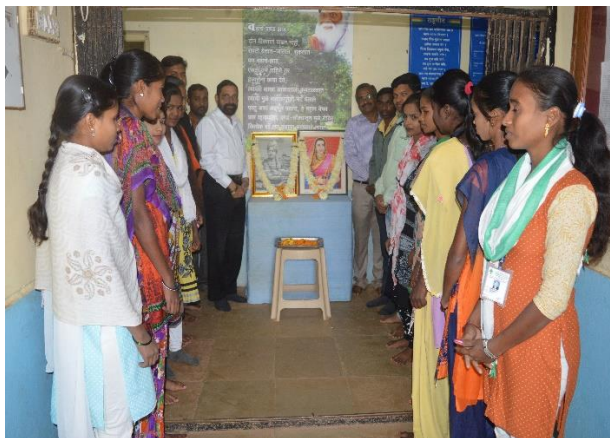
Swami Vivekanand & Jijau Jayanti