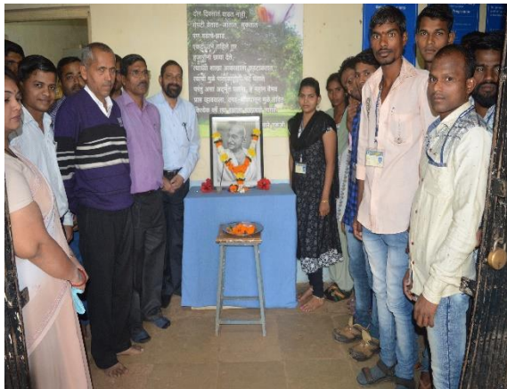
Rashpita Mahatma Gandhi Jayanti