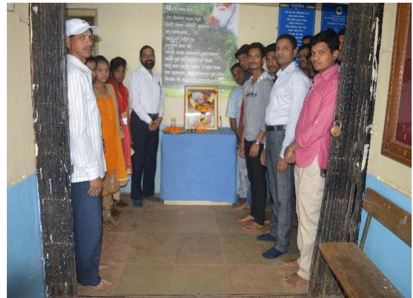
Chatrapati Shivaji Maharaj Jayanti