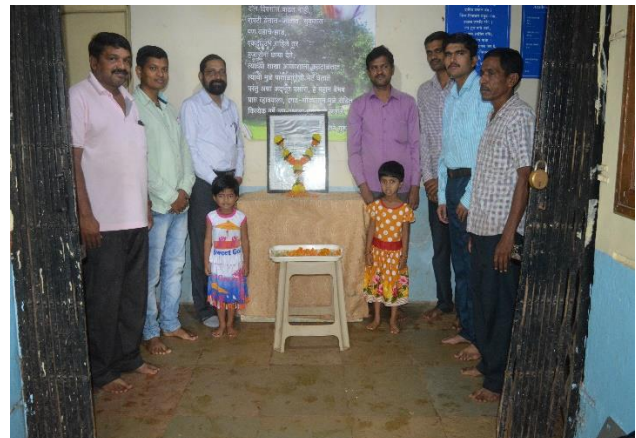
Rajarshi Shahu Maharaj Jayanti