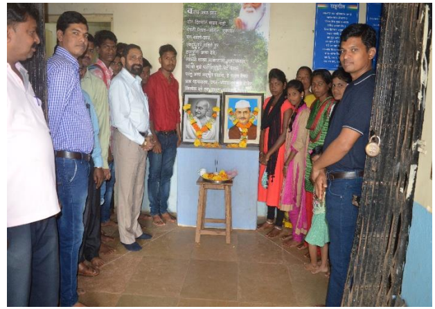
Gandhi & Lalbahadur Shastri Jayanti