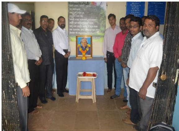
Dr. APJ Abdul Kalam Jayanti