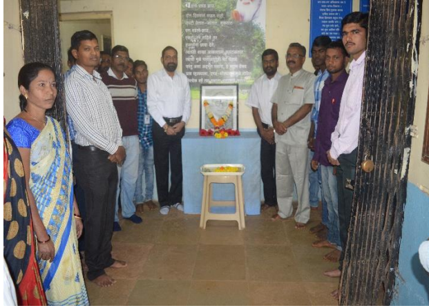
Dr. Babasaheb Ambedkar Jayanti