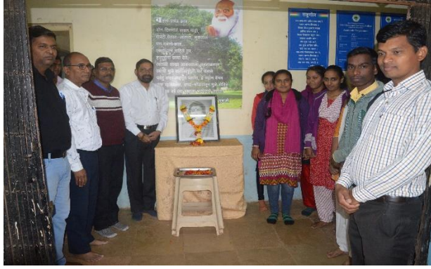
Ahilyabai Holkar Jayanti