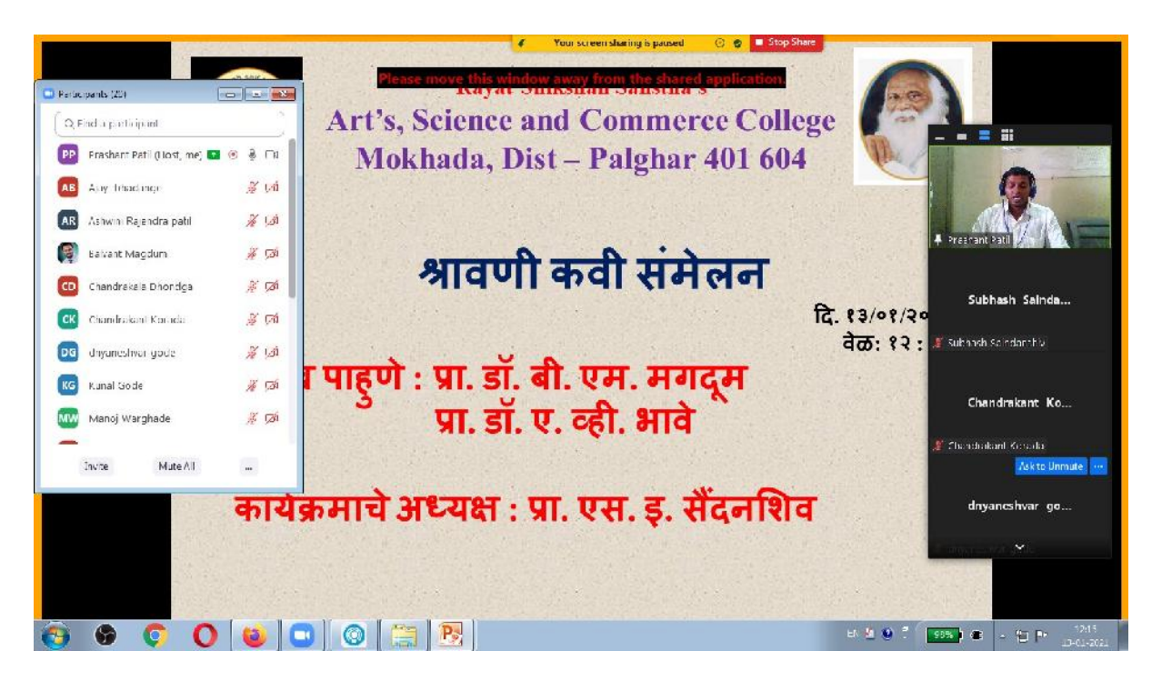
Poetry by Students

Shravani Kavi Sammelan (श्रावणी कवी संमेलन) (13 January 2021)